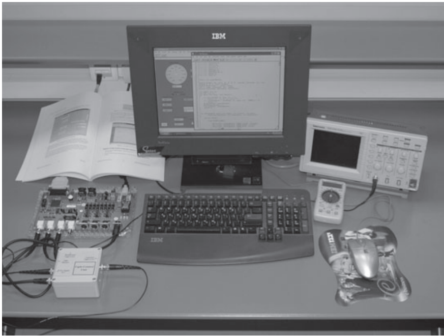
Fig. 3 A typical laboratory station, designed for the use by one or two students simultaneously. The computer is an all-in-one IBM PC, which saves laboratory space and allows the latter to contain additional stations. Note at the middle left side of the picture the compact external IO 2000 drive, which contains the required power devices and below it, the compact box that contains the experiment set-up for light intensity control.